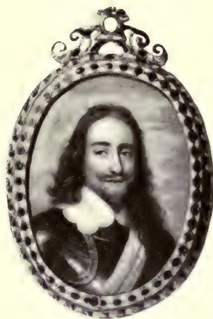
CHARLES I. BY P. PRIEUR